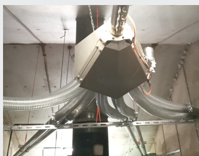
PNEUMATIC REFERRAL SYSTEM INSIDE THE ROOMS