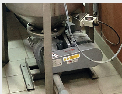
PNEUMATIC BLOWER AND VALVE AT THE START OF THE OPTIMAT AUTOMATON