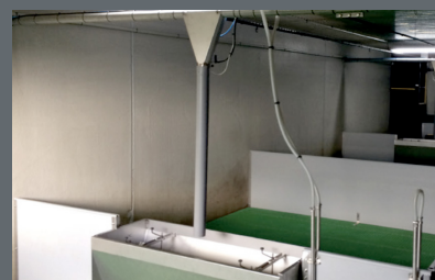
DRY DISTRIBUTION IN THE ROOMS WITH CHAIN DISK