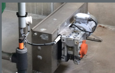
DRIVE UNIT AT THE START OF OPTIMAT AUTOMATON