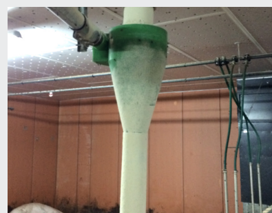
CYCLONE TO DISPENSE THE FEED IN THE TROUGHS